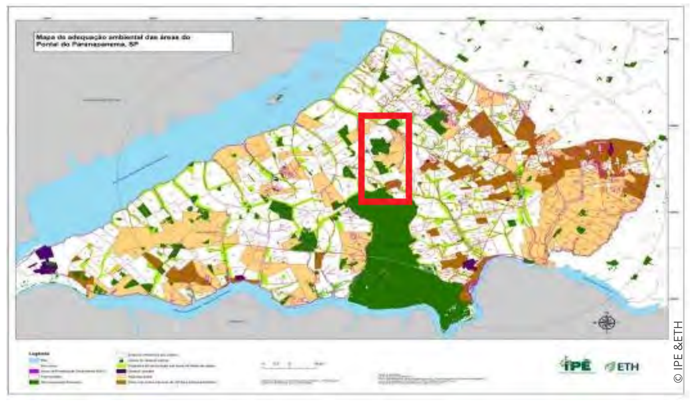
Projections of how much additional reforestation is needed to maintain connectivity in the area once the project is completed. Dark green are remaining forests and light green areas that need restoration.

Our next big step for the next 5 coming years is to restore the "North Corridor" (red rectangle in the above map) an extremely important area that will provide connectivity between the North portion of the Morro do Diabo State Park and the Black Lion Tamarin Ecological Station. This joint effort will demand 500 ha and 1.000.000 trees of restoration efforts (Figura 10). This area will need a combination of all restoration approaches such as Active, Mixed and Passive restoration.