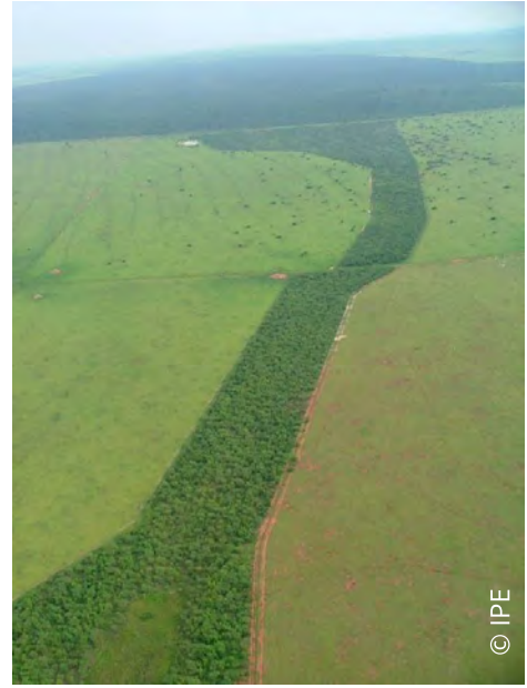
Area 6 in April 2007.