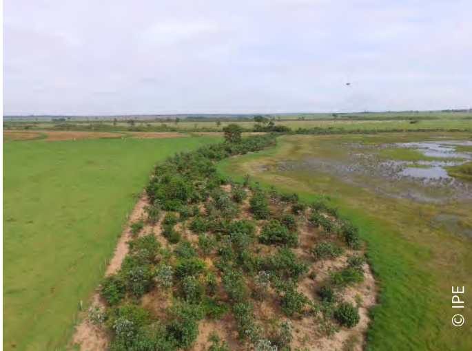
Area 3 in February 2016.