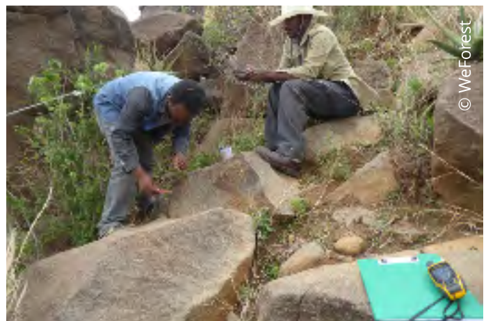
Vegetation survey in exclosure areas