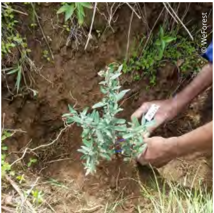
Placing biodegradable hydrogels in the ground